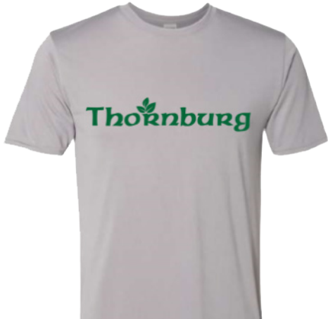
Men's Performance T-Shirt - $25

Sale Ends October 18 th CLAIM YOURS TODAY!