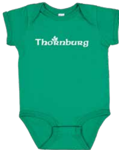
Infant Fine Onesie - $25