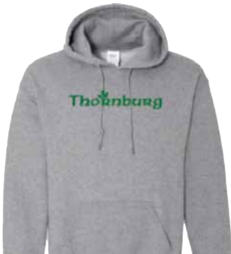
Hooded Sweatshirt - $40