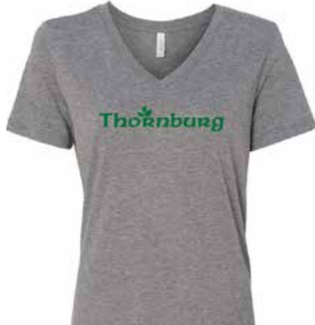
Women's Performance T-Shirt - $25