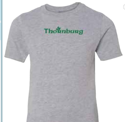
Youth Next Level Heather Grey Tee - $25