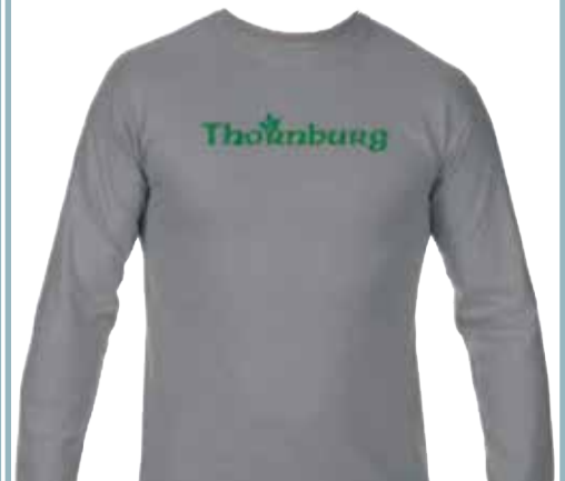
Performance Long Sleeve Shirt - $32